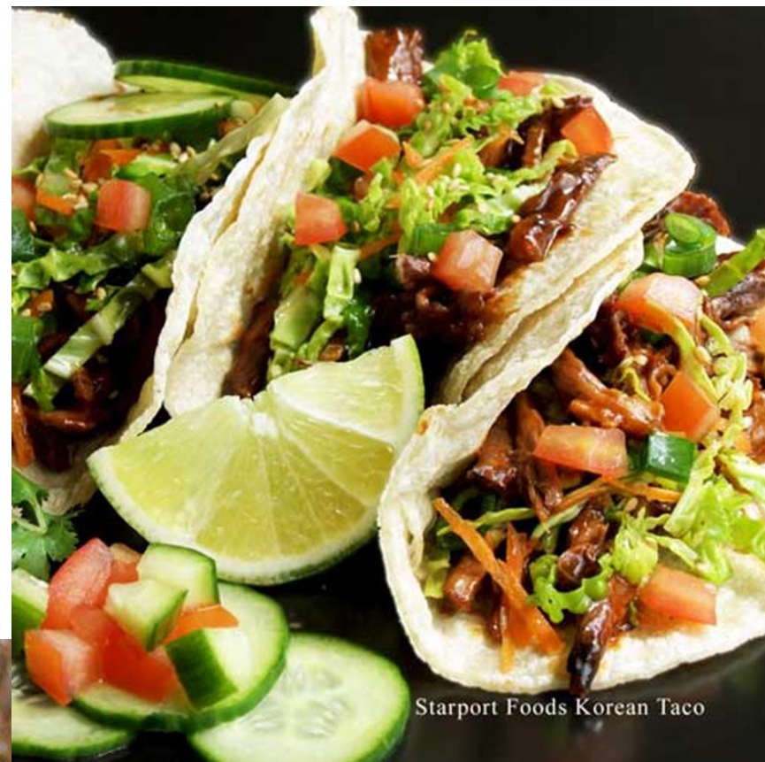
Starport Foods Korean Taco