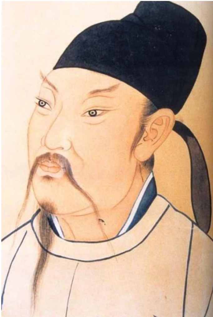
Li Bai — Chinese poet