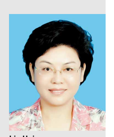
Governor of Ningxia Hui Autonomous Region, China

The "Year of the Horse" ends and the "Year of Sheep" comes. The New Year means a beautiful new beginning. On behalf of People's government of Ningxia and 6.54 million Ningxia people, I express my greetings to NEAR members for the new year.