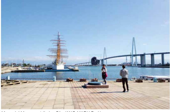
Memorial Monument (Imizu City, KAIO MARU Park)