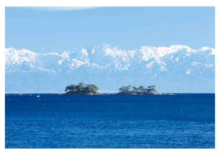
The Tatevama Mountain Range beyond the sea

Toyama is doing its best to show its attractiveness suitable for the title 'the most beautiful bay in the world' by promoting marine sports, attracting cruise, expanding marina facilities, and attracting owners for ships along with maintaining cycling course, cycle station, and café that allow visitors to enjoy the view of Toyama.